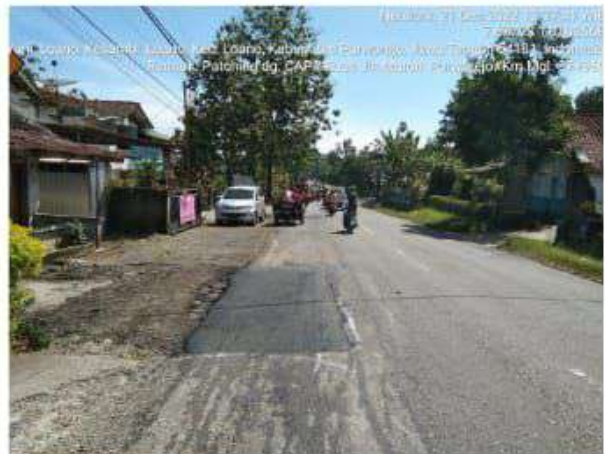
Pekerjaan Penambalan Lubang Maron Purworejo Ruas 165 Km.Mgl.37+950