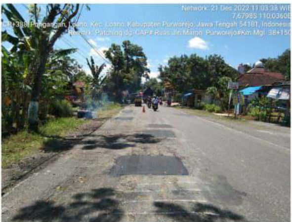
Pekerjaan Penambalan Lubang Maron Purworejo Ruas 165 Km.Mgl.38+150