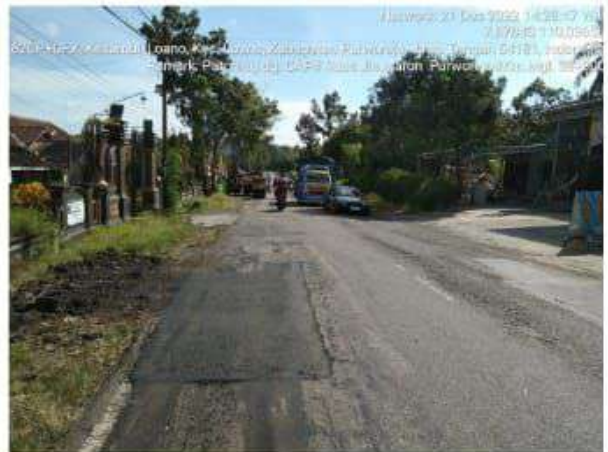
Pekerjaan Penambalan Lubang Maron Purworejo Ruas 165 Km.Mgl.38+000